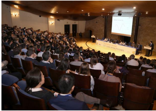
EMYO 2016 - 500 young ophthalmologists gathered in Oviedo for the 2 nd European Meeting of Young Ophthalmologists (EMYO)